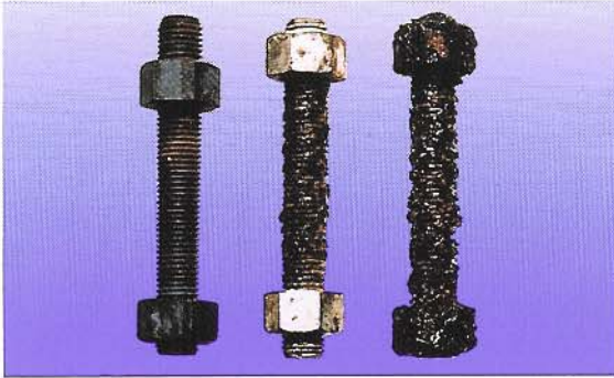
Actual corrosion tests. Left: Xylan bolt - moderate coating and oxidation damage. Nuts not frozen. Center: Cadmium plated bolt - total coating failure. Severely corroded. Right: Plain steel bolt - bolt utterly destroyed. Would fail in service.