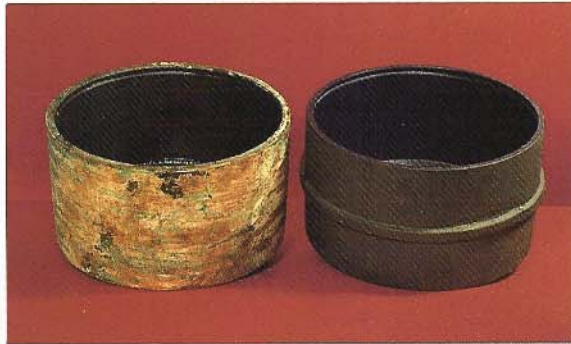
Corroded steel housing before and after cleaning and coating