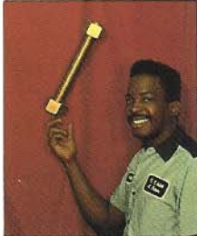
Coating shop service