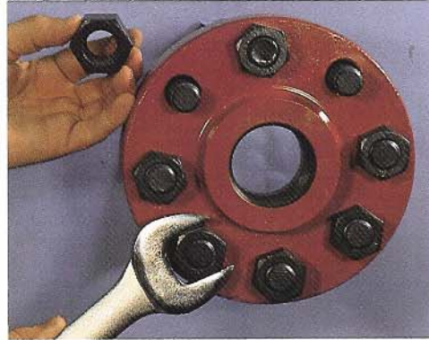
Our coatings make for "easy on", "easy off" jobs with studs, fasteners, flanges, valves and housings