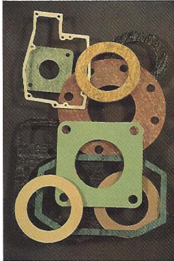
Cutting die forms made in house