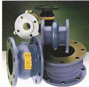
Expansion joints.