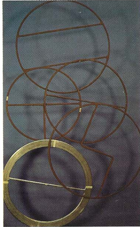
Heat exchanger gaskets