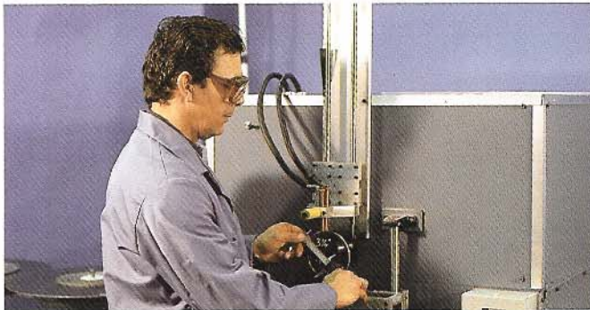
Winding fabrication service